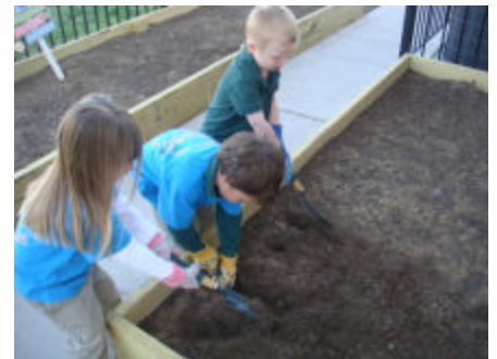
Oh What Will Our Garden Grow!